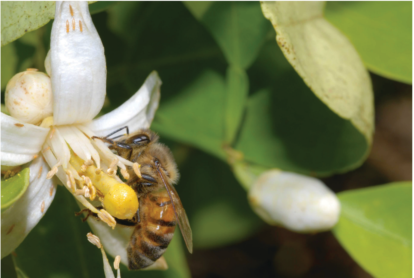
Figure 3. Honey bee on citrus.