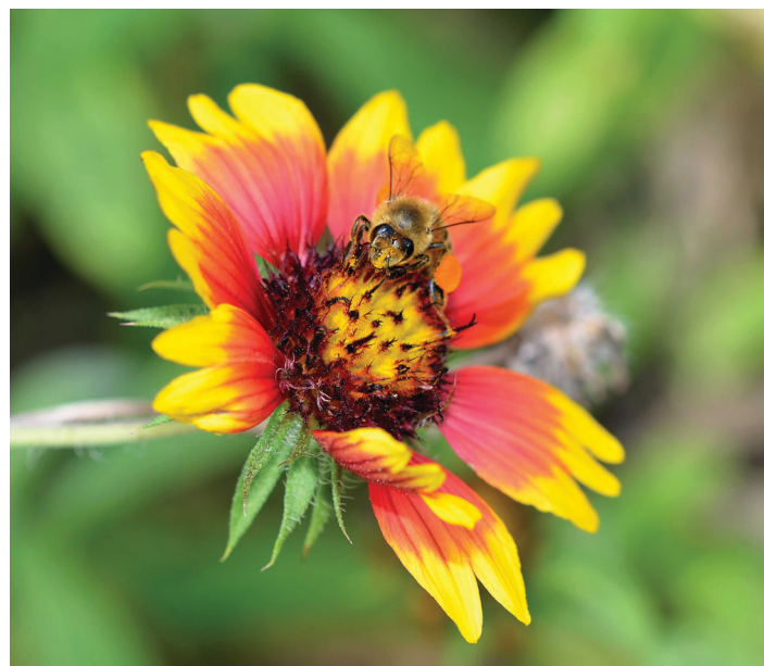
Figure 4. Honey bee on Indian blanket flower.