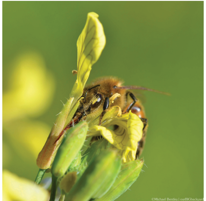
Figure 2. Honey bee on wild mustard.

While many plants are acceptable pollen producers for honey bees, fewer yield enough nectar to produce a surplus honey crop. The tables in this document list the nectar-bearing plants that are present to some degree in each region and the plants' respective bloom times. Please note, any nectar plants that are considered invasive in Florida have been excluded from this list.